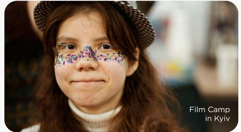
Film Camp in Kyiv

It is a valuable opportunity for the families to be surrounded by like-minded people, to share their experience and feelings. Such events help them return to normal life after difficult treatment. After all, even when the disease recedes, its psychological and social consequences may last for a long time.