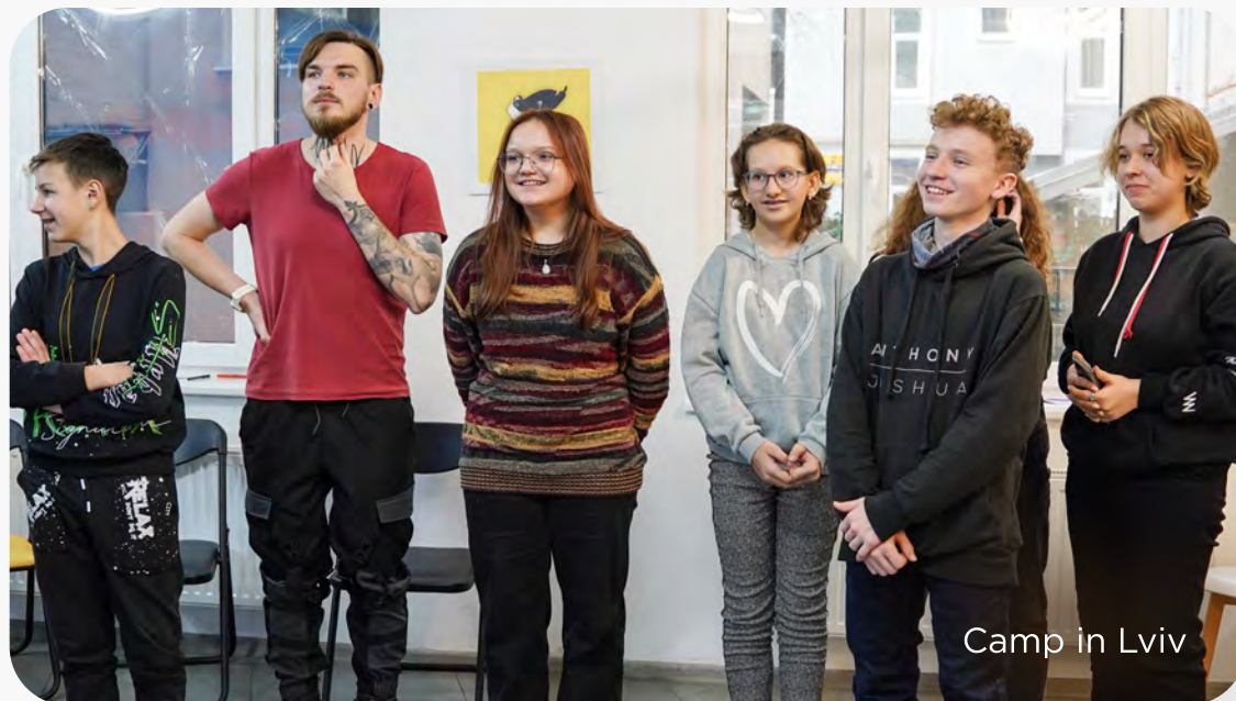
Camp in Lviv

The children who fought cancer had a great time at a five-day camp in Lviv, a five-day film camp in Kyiv (where they worked on their own films together with directors, cameramen, and acting teachers!), and a three-day camp in Heidelberg. The latter was for the families who had previously evacuated to Germany to get cancer treatment for their children and now continue their rehabilitation there.