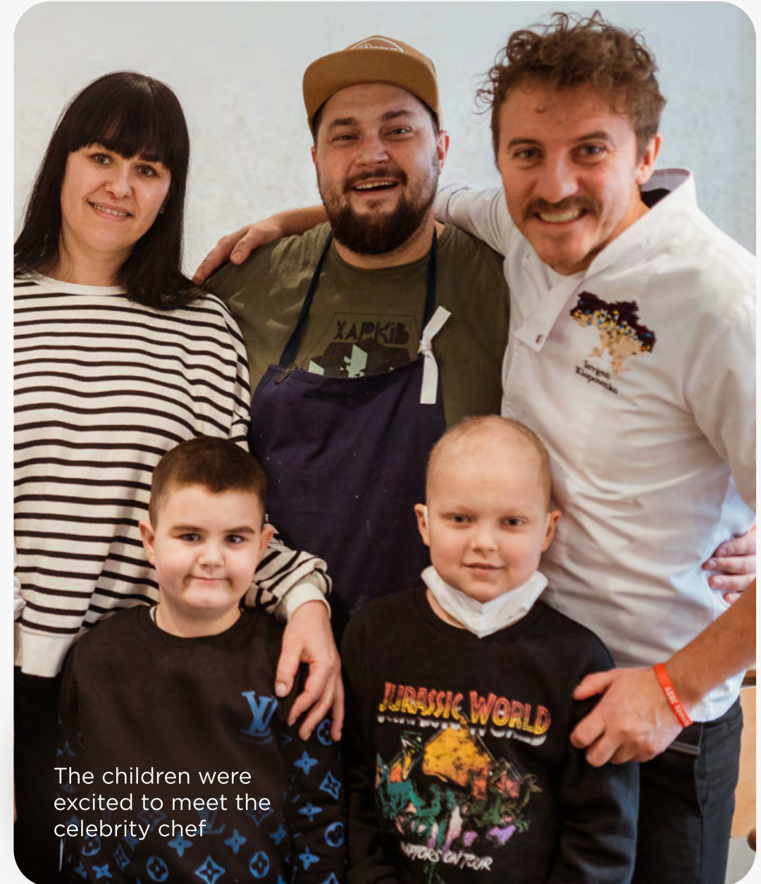
The children were excited to meet the celebrity chef